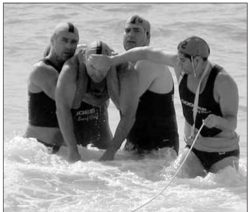
Open Mens R&R Team at Coogee Carnival