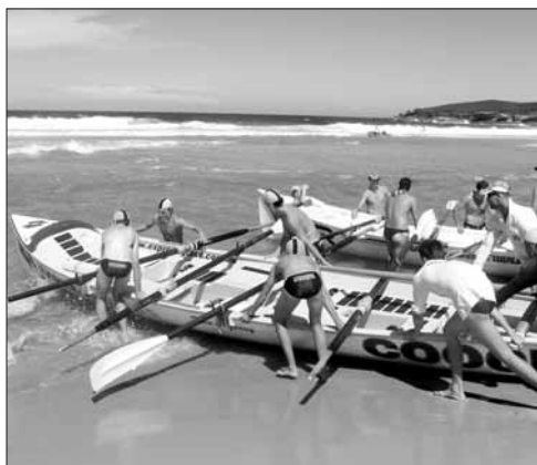
Featherweights – ready to launch at Branch