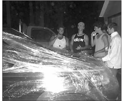
top: Fun and games: Juniors cling wrap Stixy's car, employing 420 metres of wrap, discovered at 6am in the morning.