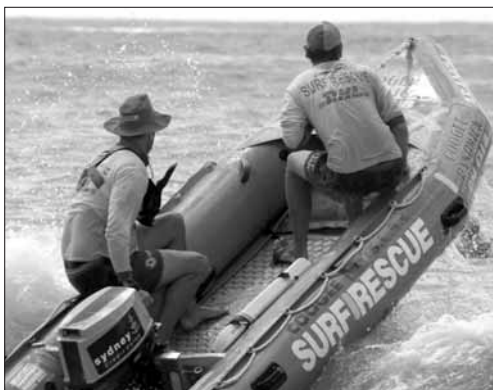
Caltex Kensington supports the IRB section