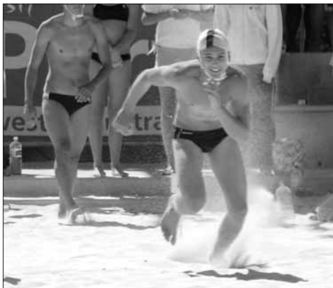
Our runners had a great season.

At a club level, this season saw 118 club members compete in our intra club events, such