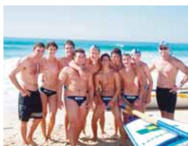
Scenes from 06/07: Clockwise from top – Our Junior Board Paddlers; Juniors at State; Junior Club Champo's; Lightning Bronze; Junior Patrol.