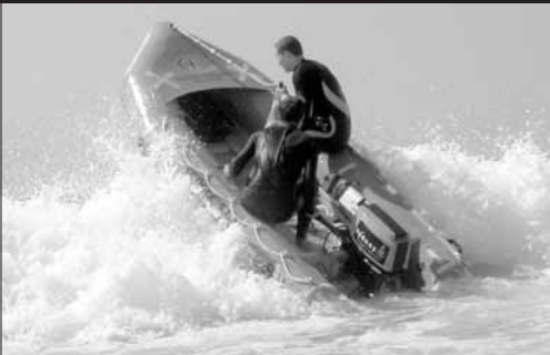
IRB IN FULL FLIGHT AND OTHER SCENES FROM 06/07