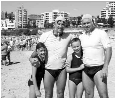
Unbeatable father and son combinations.