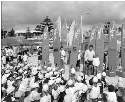
Coogee Beach on a Sunday morning: full of Minnows.

We are very proud of the five boys and four girls who represented Coogee in style at the development weekend and supported each other so strongly across the many challenges put in front of them.