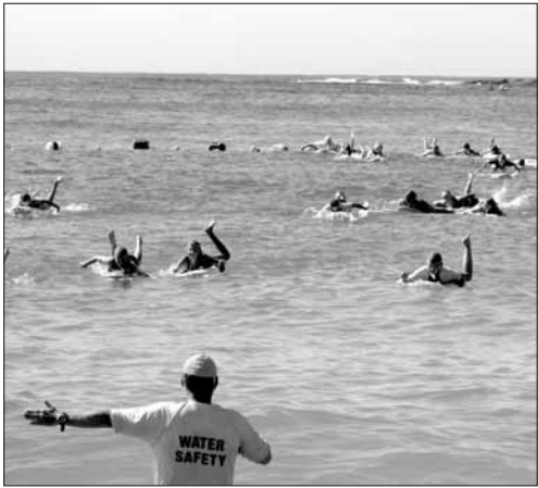
Coogee Minnows board paddling training

The most remarkable addition to the group at this stage was the contribution made by some of the parents. Despite only having two registered water safety parents in the group, the weekly chore of recruiting surf patrol to help us proved sometimes difficult as we would have to wait for their availability. This is where some of the more swim confident parents took to the water to assist water safety, which enabled the whole group to complete more board paddles and swims each week. Their contribution was invaluable. The kids loved having the parents in the water too. In particular it allowed less confident swimmers to be encouraged to a higher standard.