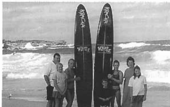
"Wizard of Oz Backpackers present new boards to our paddlers."