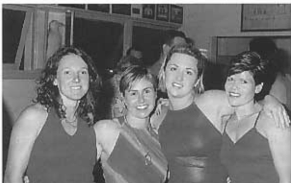
"Some of the girls looking Red Hot on New Year's Eve."

To happier note, I wish to extend my sincere thanks to