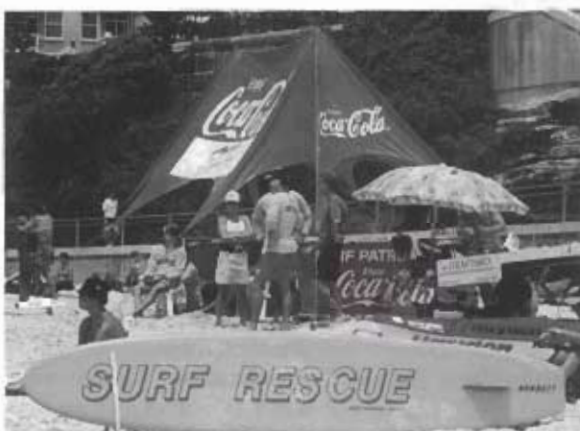
"Patrol on carnival day."