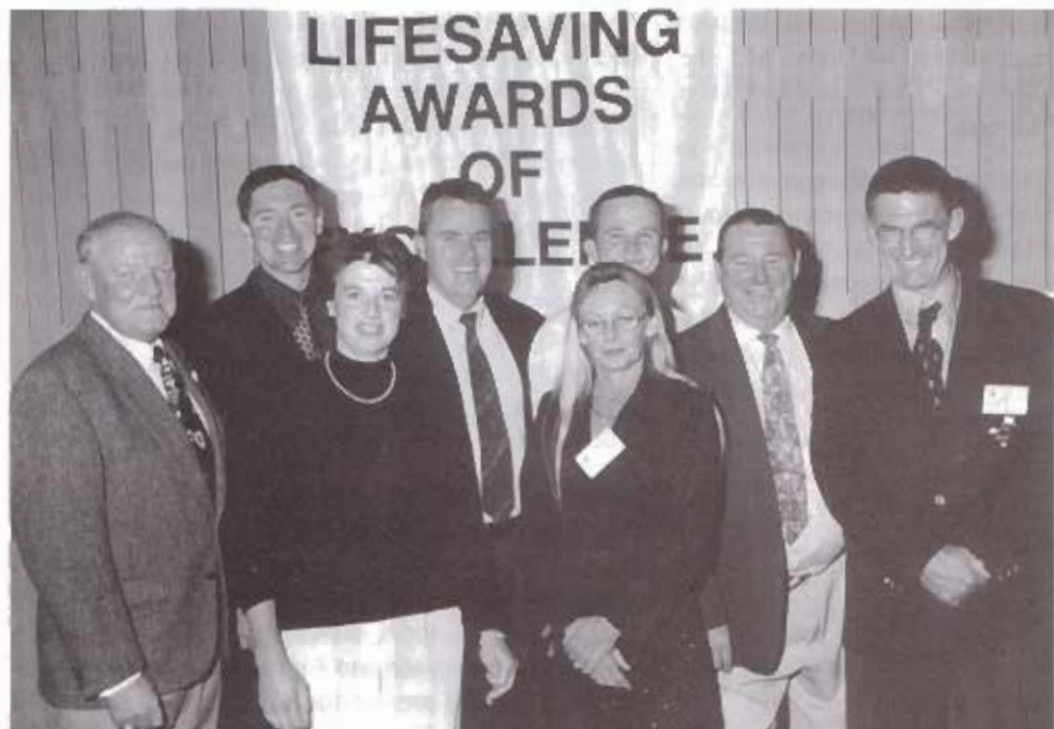
"Representatives at the NSW Awards of Excellence 2001."