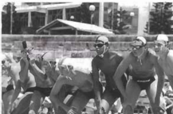
"Younger members of the Smartline - our future looks good."