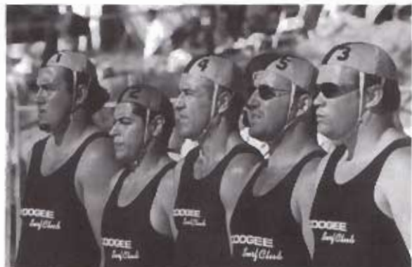
"Open 5 man R&R."

The ski area showed more potential this year with Habler/Reid and Habler/Habler making the semi finals in the double and mixed double-ski and with the coaching instigated we expect to have more U19 and women paddlers next season. We are looking to strengthen this area with new skis and more U19 competitors. The ski area appears to be a growing area at carnivals. At the Aussies there were over 450 senior ski competitors and 175 U19 competitors.