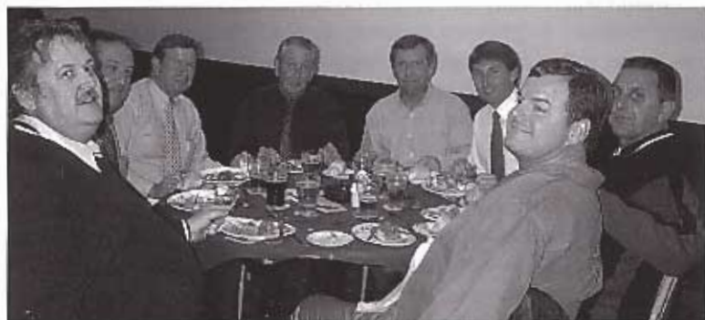
"Some of our more financially astute members at the annual dinner."