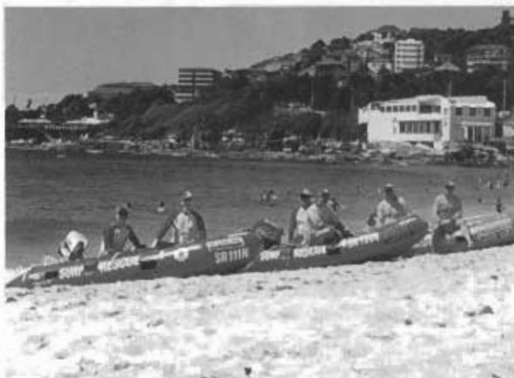
"IRBs on duty."