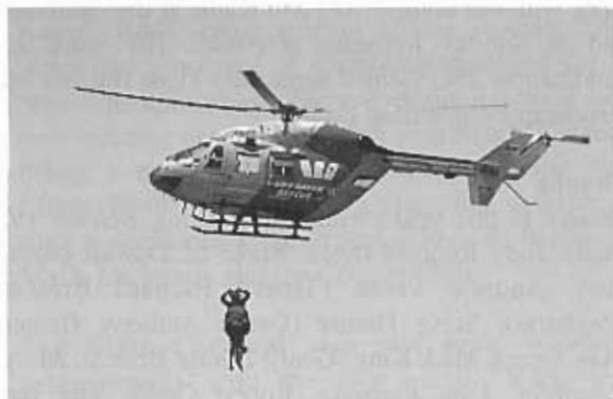
"Mock rescue with the Westpac Helicopter at the Splash 'N' Dash."