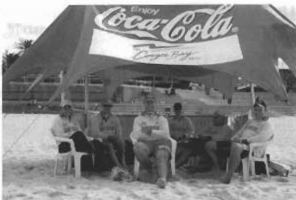
"One of our patrols ready for action."