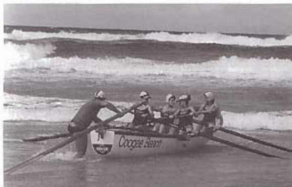
"Womens Boat Crew at the Australian Titles."