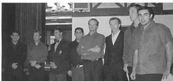
"5 and 10 year 100% Patrol Winners."