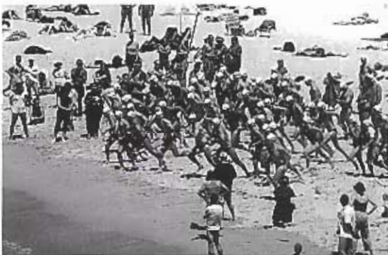
"They're away! Some of the competitors in the swim for the Splash 'N' Dash."

The biathlon event was held for individuals as well as teams and commenced with guest starter local