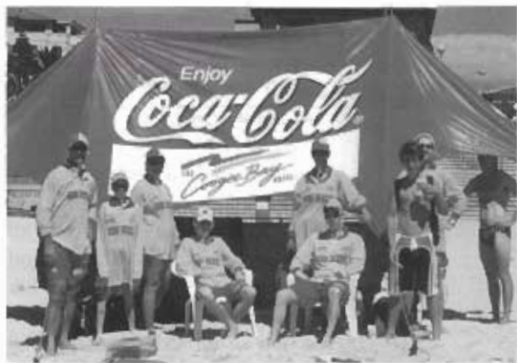
"On patrol" with support from the Coogee Bay Hotel"

previous years, it is still good to see that there is a sizeable gap between the number of people joining the Club and the number of people leaving the Club, thus ensuring the Club's membership stays strong. A detailed breakdown of the number of awards gained by the Club can be found within this annual report.