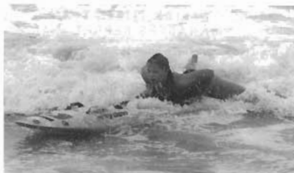
"Lara Middleton in action."