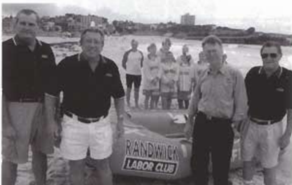
"Presentation of our new IRB, kindly donated by the Randwick Labor Club."