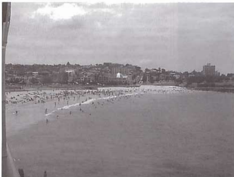
"Coogee Beach 2001."