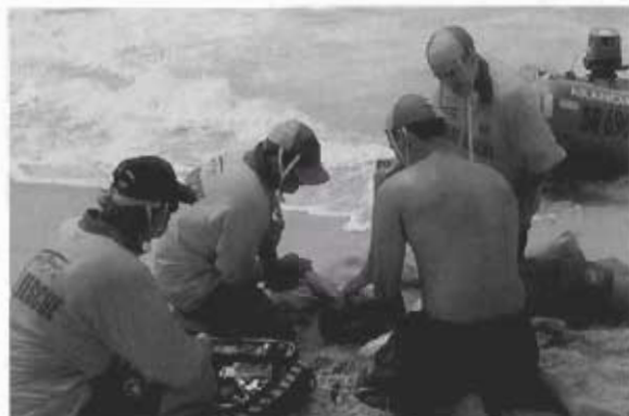
"Patrol inspection in progress."

This award is based upon a Patrol's performance for the Season. It takes into account the Patrol's results in