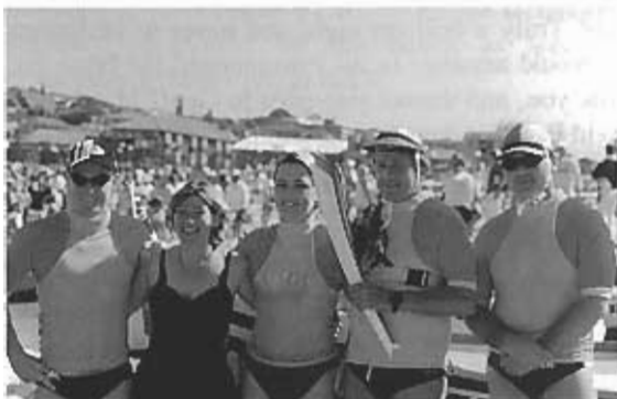
"The day the Olympic Flame came to Coogee."

On a serious note however there are two issues that continually face the social secretary. The first being the introduction of the GST. When people always compare to last year it is now very hard to get the