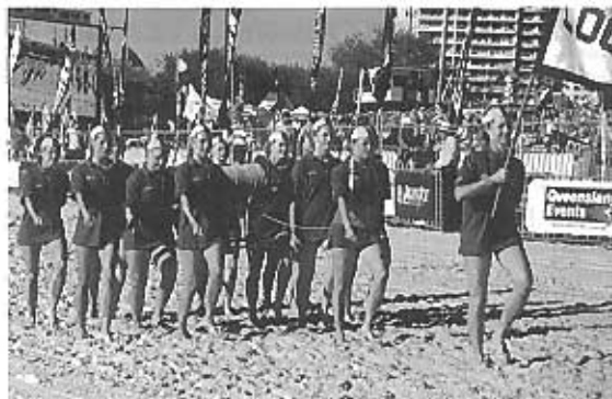
"March Past Girls at the Aussies."

Sydney Branch Carnival day was a great day for the