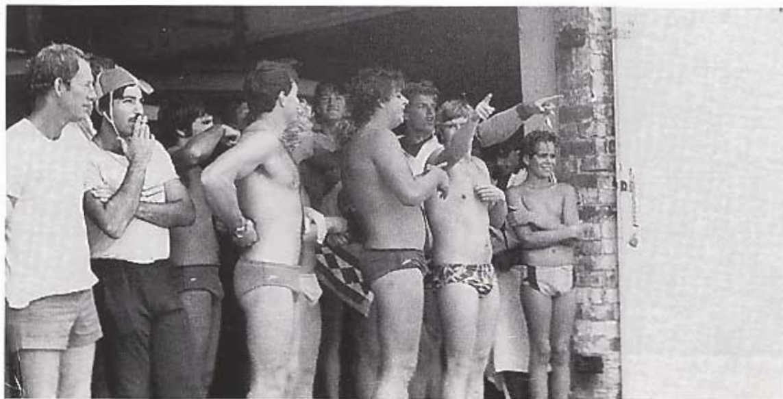
Still arguing about handicaps - Members Line up for Sunday Events (circa 1975)