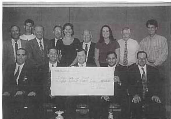
The Management Committee receives the Annual Donation from the Holiday Inn