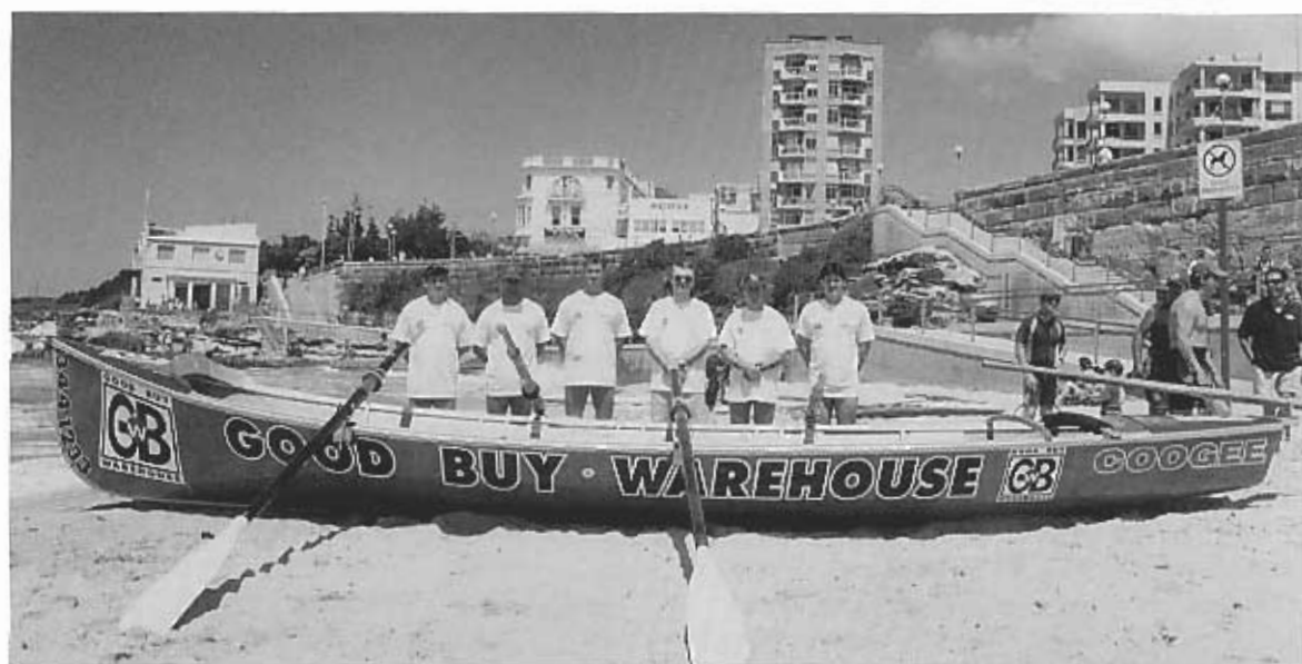
The launch of the Good Buys Warehouse "Butcher Bill" Boat