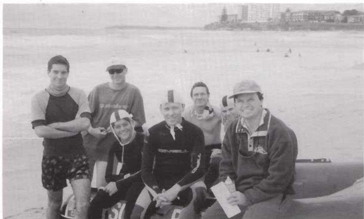
IRB Competitors North Cronulla