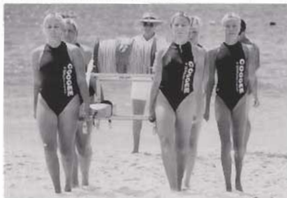
Coogee U/16 R & R Team