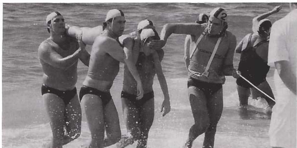
Coogee Open 5 Man R&R Team