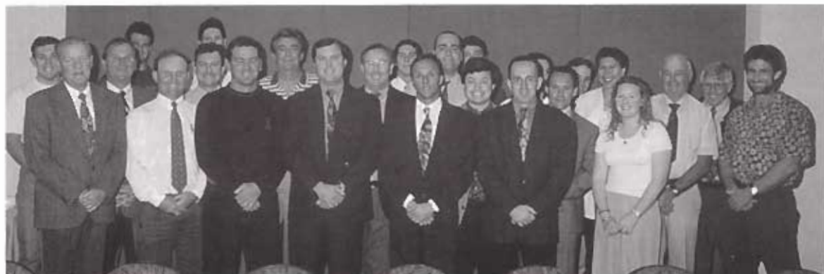
Some of the Office Bearers - Holiday Inn Planning session October 1995