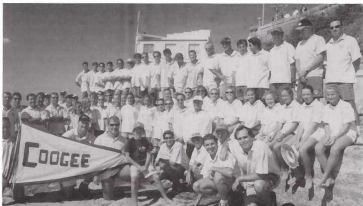
Australian Touring Team 1995/96