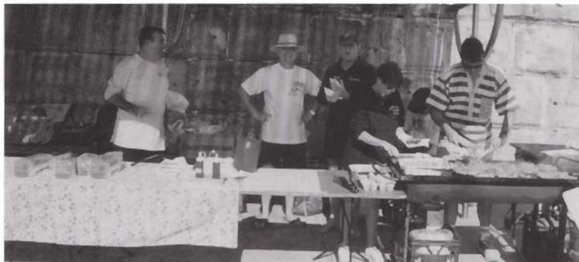
The Minnows Committee at work - Coogee Carnival 1996

dren plus parents on the beach the day was enjoyed by all. The helpers who set up the beach at 6.00am and those still on the beach at 6.00pm the Club thanks you. On the day the club results were no match for the bigger clubs down south but all of our competitors tried hard and numerous medals were won by the Club. Congratulations to those members who gained placings and the rest of the Minnows for their great sportsmanship on the day.