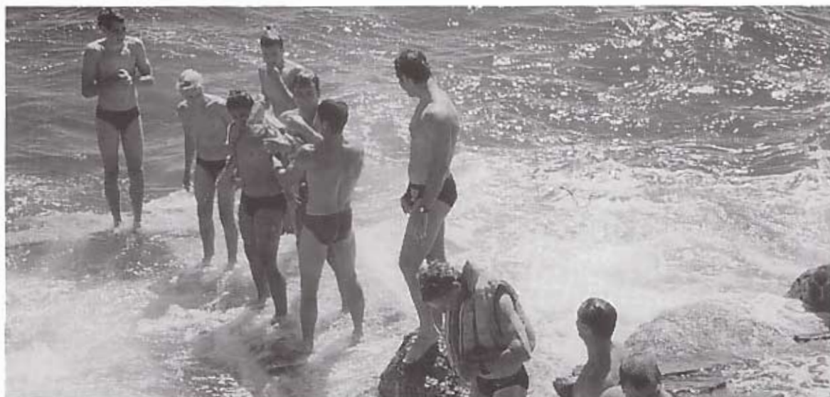
Action during the Mens V Brats