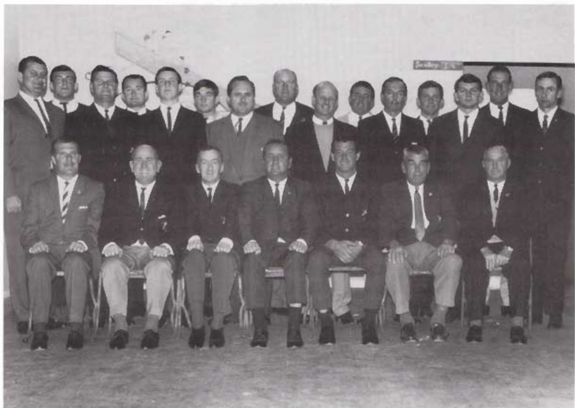
The Old Timers Line Up- Committee 197