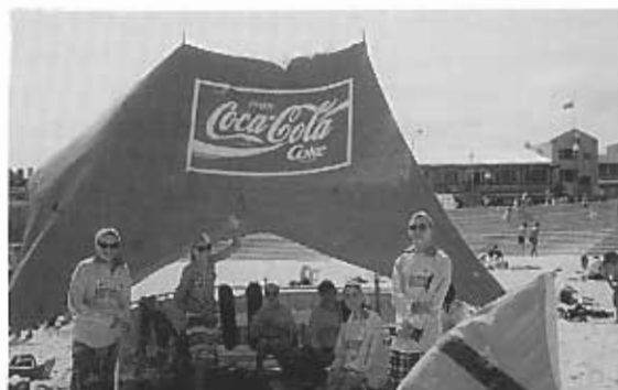
On Patrol 1995/96