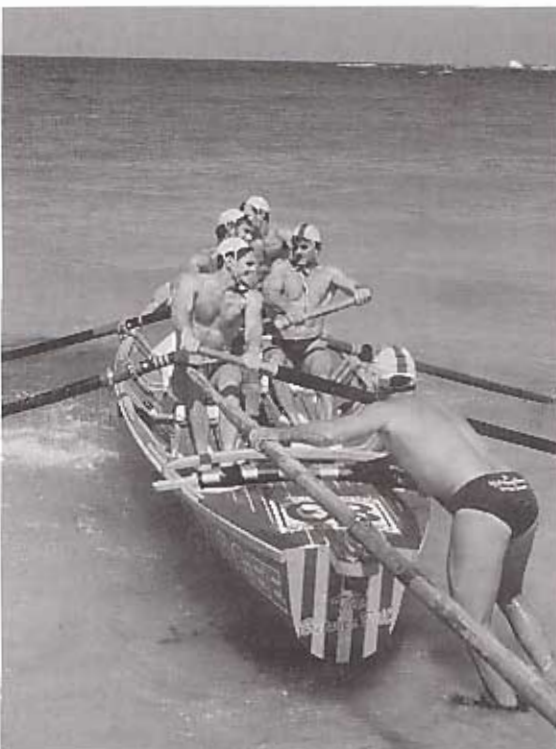
Some of the Boaties in Action

After a Pool Relay, Chariot Race and Flags the winners were The Men.