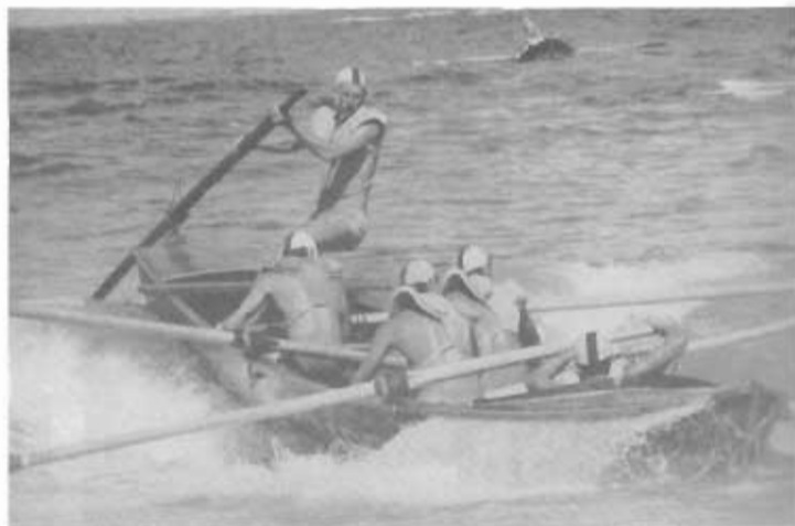
Sodge at the helm.