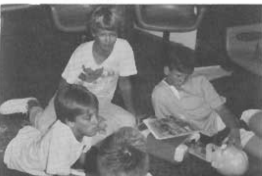
Bronze and Q.C. Training 1986 style