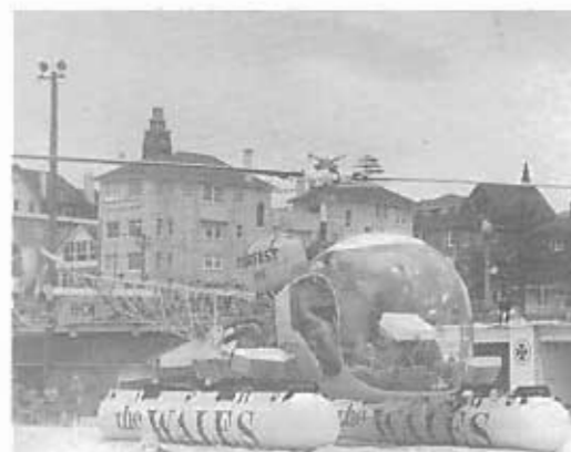
The Wales chopper arrives at Coogee.