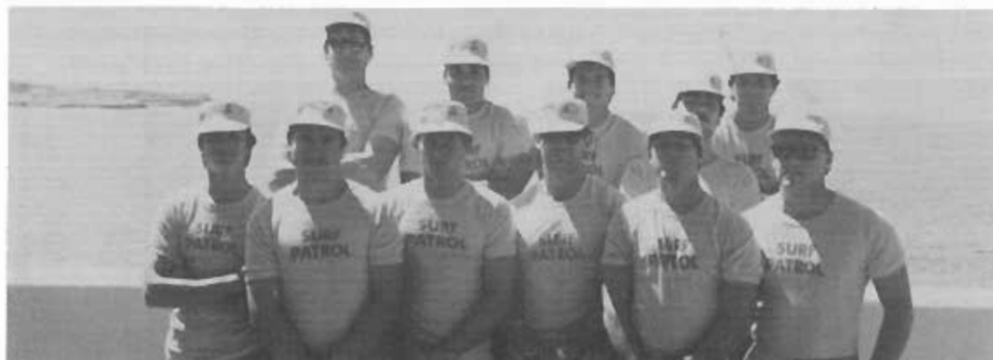
Rogues Galley - Our Patrol Captains Left to Right