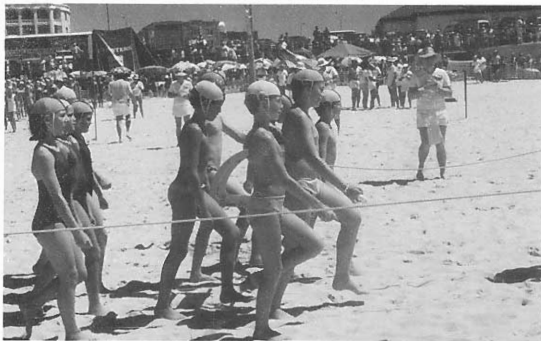
Minnows competing at junior Metropolitans at Freshwater