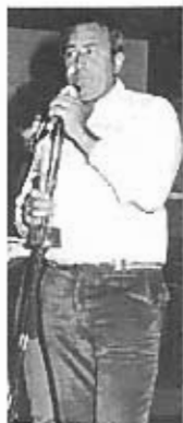
K. K. dishes out a bit!