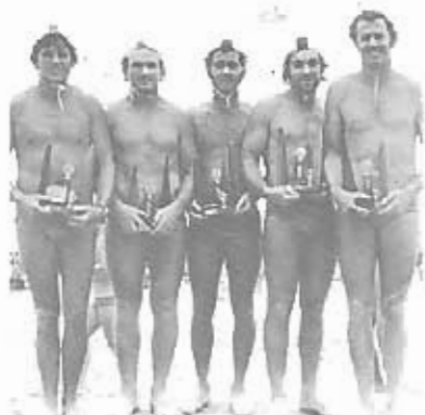
Aust. Open Surf Boat Champions — Blacksmiths 1971-72 — Noisey, Roundhead, Sleepy, Nek Yek & Ocky.