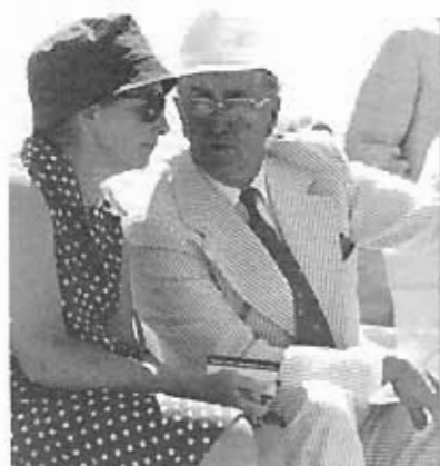
The Judge at our Carnival.