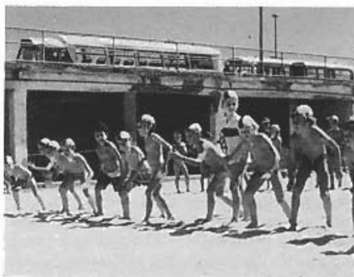
Beach Sprint Starters