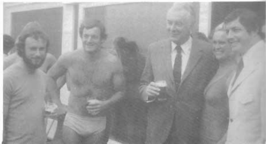
Spock (Bob Cocking) & Ian Badham enjoy a Millers with Gough (then Prime Minister of Australia).