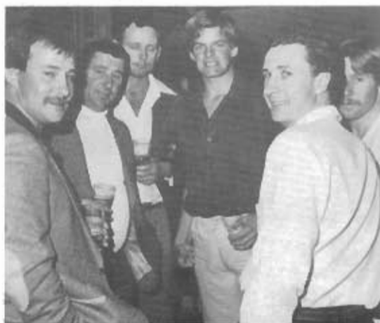
After an Annual Dinner.