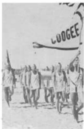
State Champions — 1970-71.