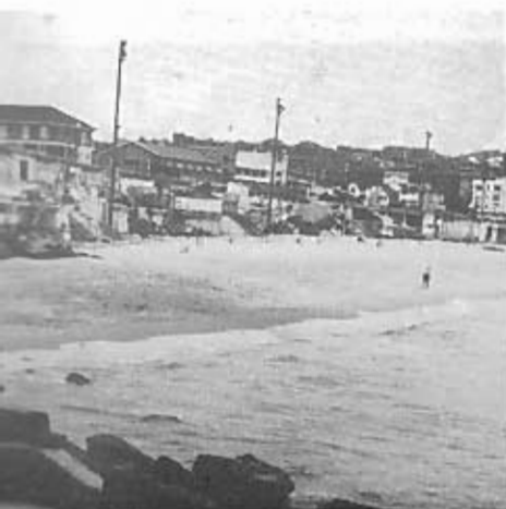
Storm Damage — 1974.