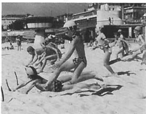
Sunday Morning Flags