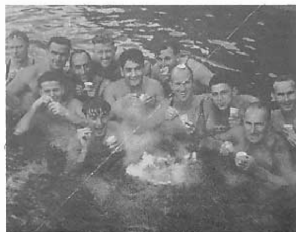
Penguins Area — 1950.