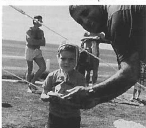
Minnows Presentation Day