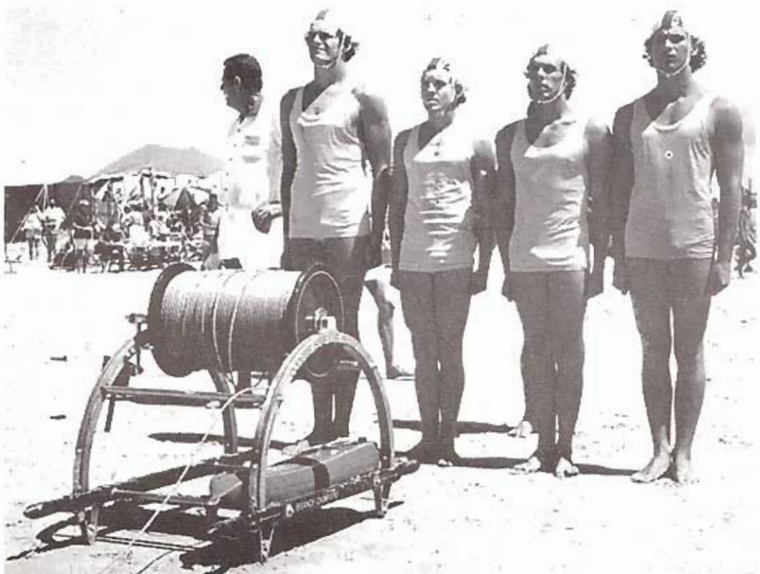
OPEN 4-MAN R. & R.

Ski Relay: 2nd Australian Championships, 2nd N.S.W. Championships (B Team), 2nd Branch Championships, 1st Coogee (A Team), 3rd Coogee (B Team), 3rd Garie, 3rd Bondi.