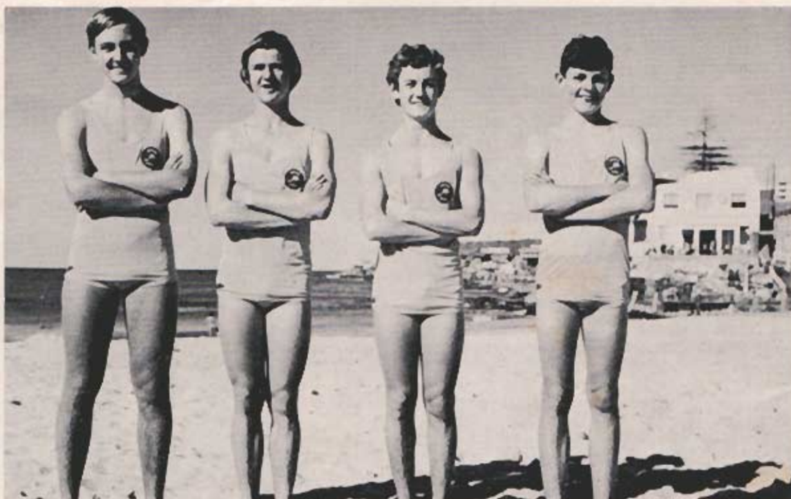
CADET BEACH RELAY