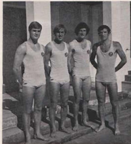
SENIOR BEACH RELAY

Branch and Australian Junior Beach Sprint Championship 1970-71